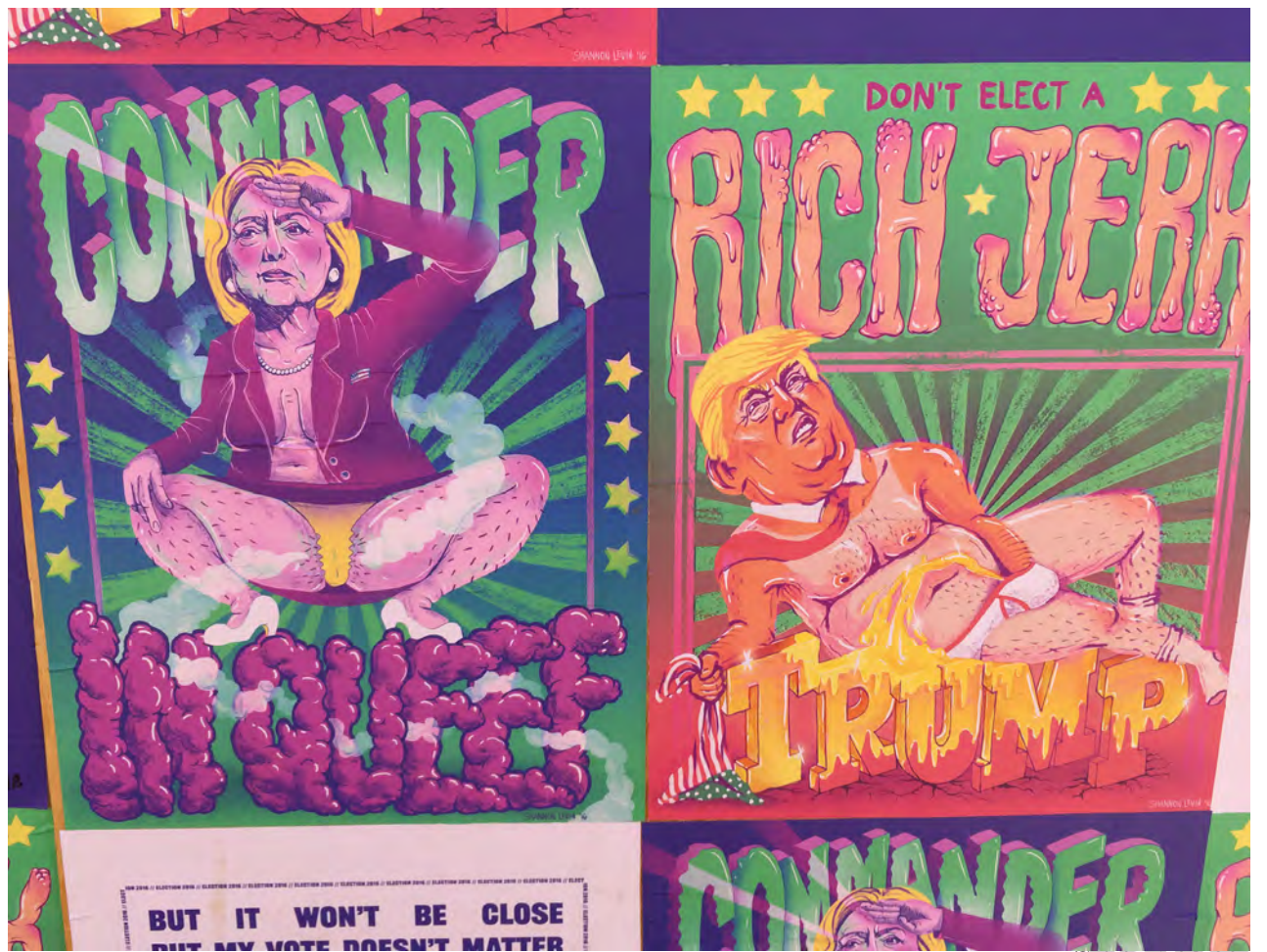
Posters made by seniors Shannon Levin and Noah Baker adorn a wall built for Art Council’s debate installation art. The wall was placed outside the Mallinckrodt center in Bowles Plaza.

Across Mudd Field is “Neighborhood Watch,” a white picket fence by Katie Yun. As a symbol of middle-class suburbia, Yun increases the size of the picket fence to personify its “threatening and indomitable” presence. “By only taping the printer paper