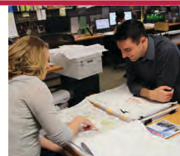
Collaborating on a project

"My most recent internship was in Downtown St. Louis with PGAV Destinations. I was a full-time architectural designer over the summer."