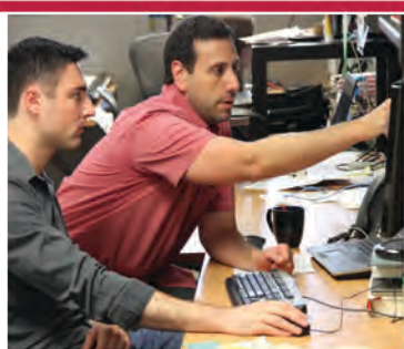
Learning on the job

"My most recent internship was in Downtown St. Louis with PGAV Destinations. I was a full-time architectural designer over the summer."